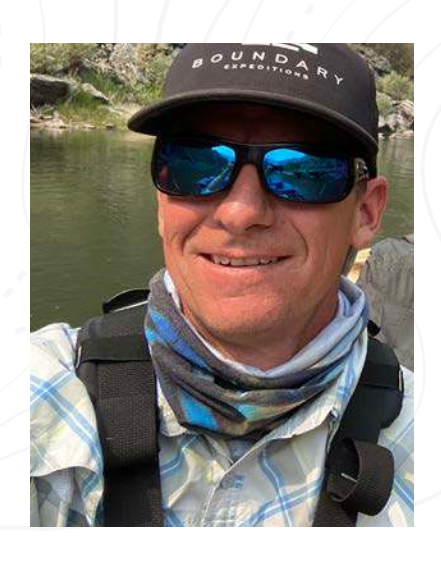
BE BUFF AND HATS