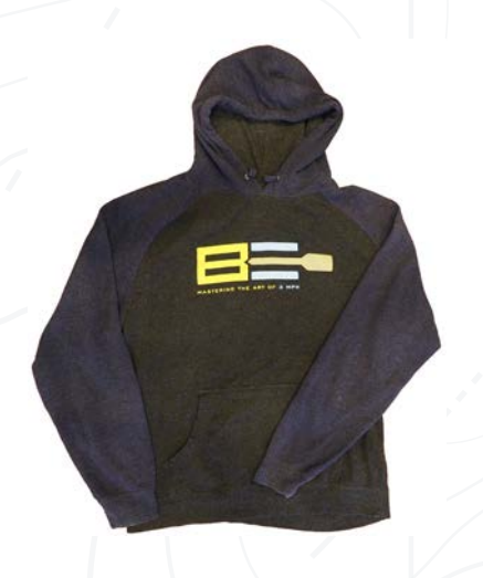
BE SUPER COMFY HOODY