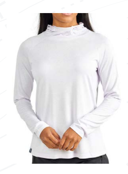
FREE FLY BE SUN HOODY