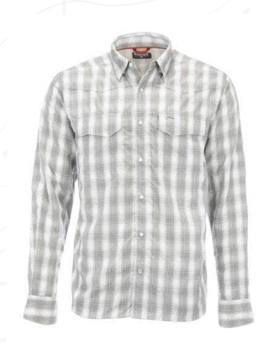
SIMMS BE GUIDE SHIRT

WE HAVE GREAT RIVER WEAR AVAILABLE FOR PRE-ORDER FROM THE 'BE EQUIPPED' SHOP: