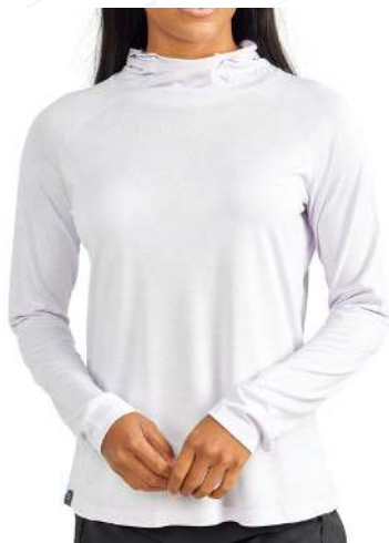
FREE FLY BE SUN HOODY