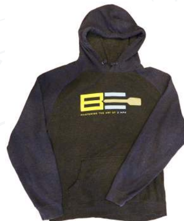
BE SUPER COMFY HOODY