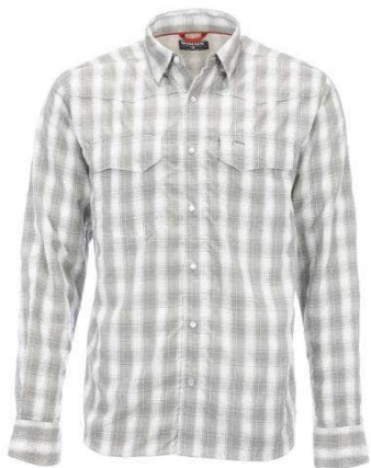
SIMMS BE GUIDE SHIRT

WE HAVE GREAT RIVER WEAR AVAILABLE FOR PRE-ORDER FROM THE 'BE EQUIPPED' SHOP: