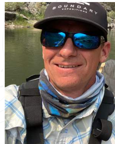
BE BUFF AND HATS