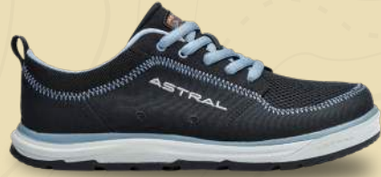
ASTRAL RIVER SHOES ASTRALDESIGNS.COM