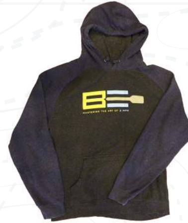
A COMFORTABLE FLANNEL OR THE BE SUPER COMFY HOODY FOR CHILLY MORNINGS OR EVENINGS AROUND THE CAMPFIRE