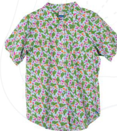
FUN OR FANCY SHIRT FOR THE LAST NIGHT ON THE RIVER